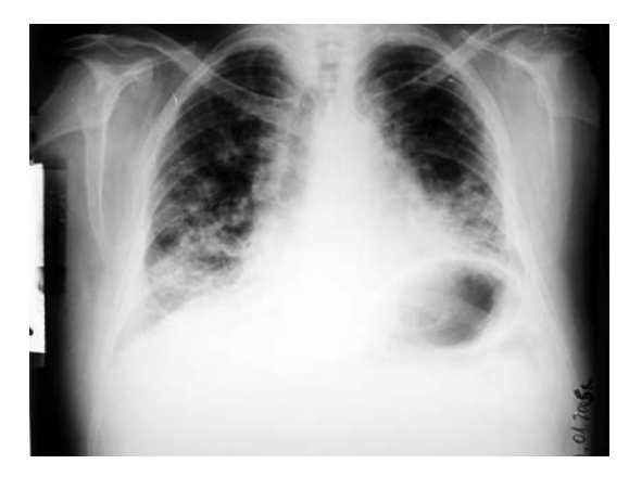
Figure 1. Admission chest X-ray. Status after partial resection of the left lung. Diffused ground-glass opacities in middle and inferior lung sections characteristic of pulmonary fibrosis. A small amount of fluid in the left thoracic cavity